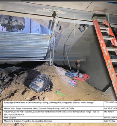
Installation Example (ToughEye 1700)

Successful product implementation and support for new mining customer base.